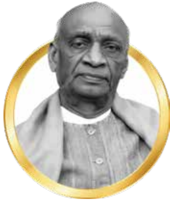
Sardar Vallabhbhai Patel